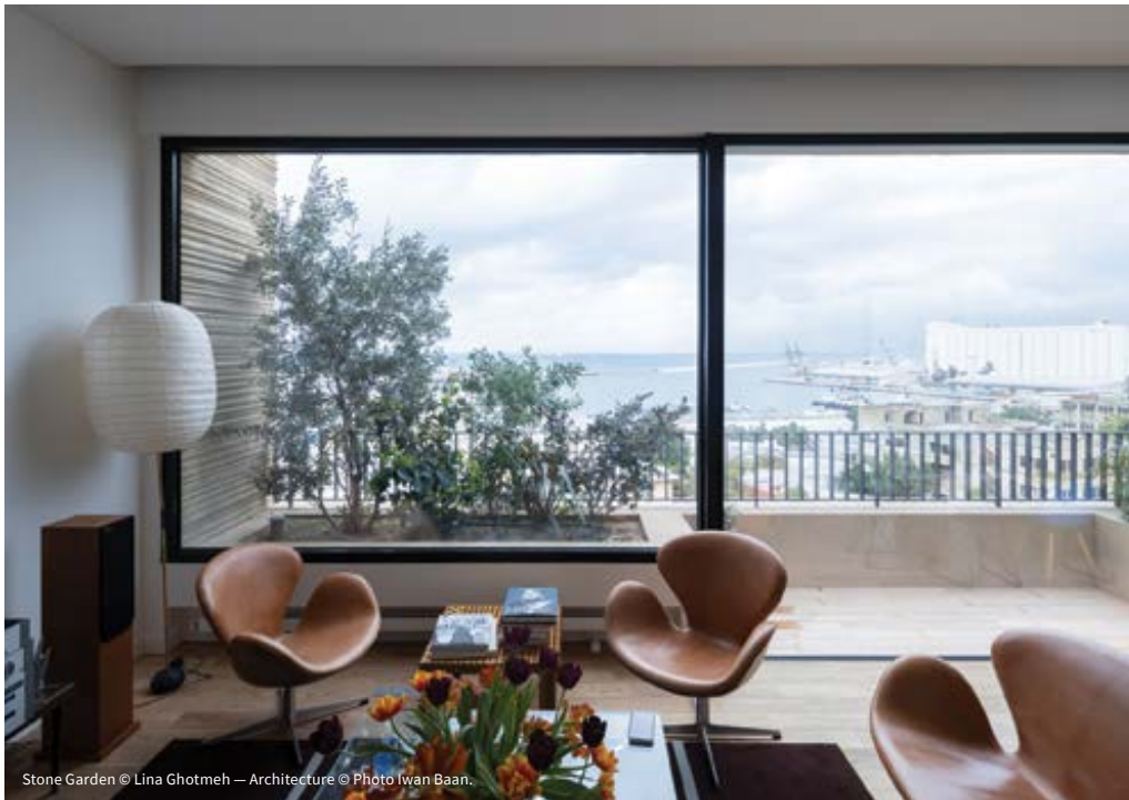
Stone Garden © Lina Ghotmeh — Architecture © Photo Iwan Baan.

C an you tell us about growing up in Beirut – did your impressions of the city impact the way you approach architecture today? Growing up in Beirut left a great mark on my approach to architecture, but also guided my interest in the field in the first place. Beirut is an open archaeology, layered both horizontally and vertically — layers of history and civilisations are constantly unveiled at the start of many constructions. The urban fabric of the city is a direct expression of its inhabitants' diverse culture. Spatially, it is the city of possibilities and alternatives. Spaces are in constant negotiation with the environment, always revealing very interesting architectural conditions; diverse architectural identities, expressive in their textures, porous through their envelopes and inhabited by an organically growing nature. There is an intensity of life that transpires out of some of these conditions (human, material and natural), one that I always seek in the designs I create with my atelier.