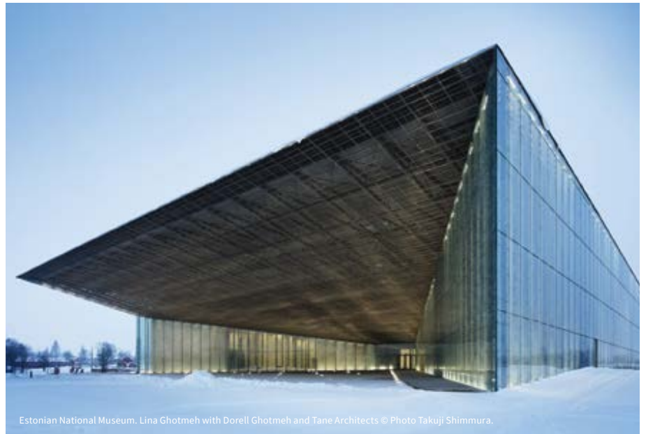
Estonian National Museum. Lina Ghotmeh with Dorell Ghotmeh and Tane Architects © Photo Takuji Shimmura.

Currently among our projects is our construction of the Hermès Louviers Workshops in Normandy, a project I designed with my atelier, holding very high sustainable ambitions — a low-CO 2 , passive building. The project is made with hand-crafted artisanal bricks and sits calmly in dialogue with its surrounding landscape. Exploring the dancing body and the city, I am also working on the design of the National Choreographic Centre in Tours, [which is] meant to be completed in the coming couple of years. Worth mentioning lastly is a private museum and a house for an art collector in Europe, among others. 📍