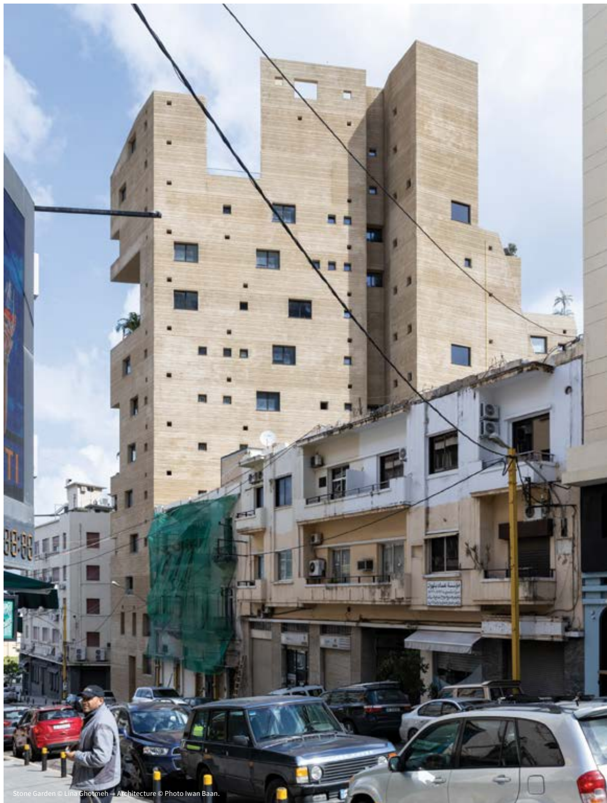
Stone Garden © Lina Ghotmeh — Architecture