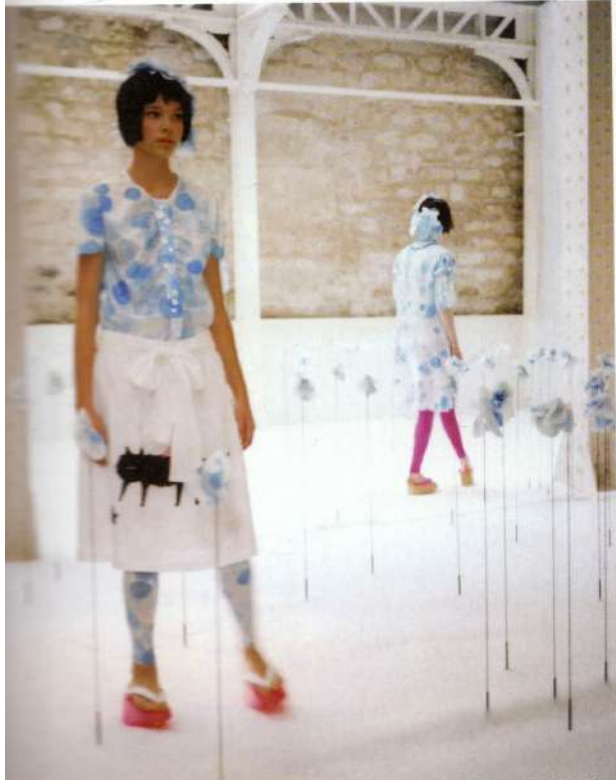
Top: Rain Chukka fabric Left: Catwalk for the Spring/Summer 2007 collection Bottom left: Neighbourhood pattern from Spring/Summer 2006 collection Below: Necco with embroidered cat pattern