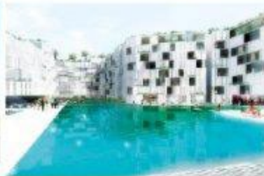
1&2. Stone Garden 3. Metropoli